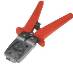
Universal Ferrule Crimper